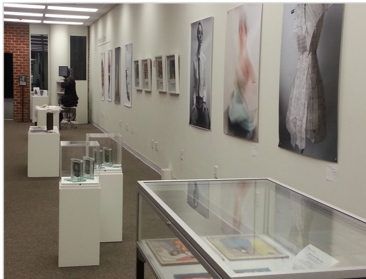
Fenwick Gallery: First Exhibit, 2014