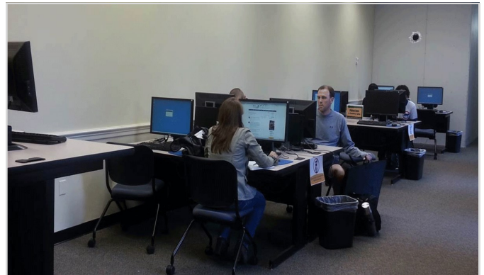
Fenwick Hallway: Computer Workstations, 2013