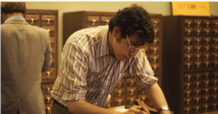
Fenwick Hallway: Card Catalog, 1978