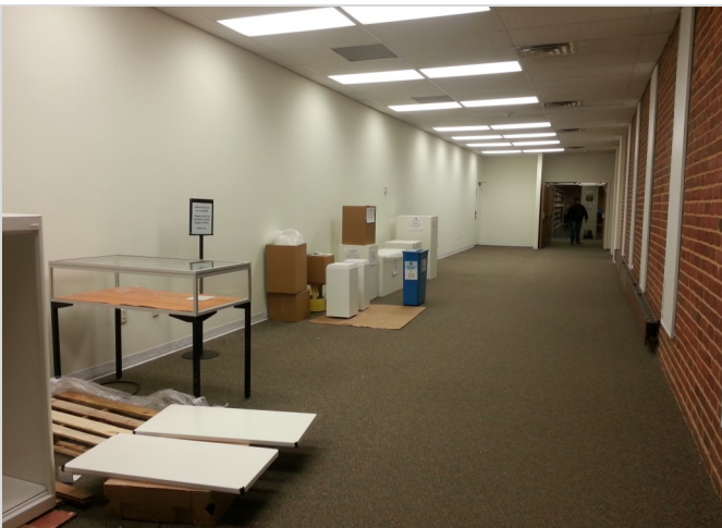
Fenwick Hallway: Gallery Preparation, 2014