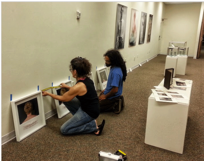
Fenwick Gallery: Exhibit Installation, 2014