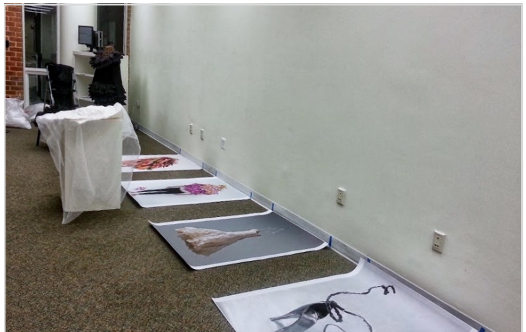
Fenwick Gallery: Exhibit Installation, 2014